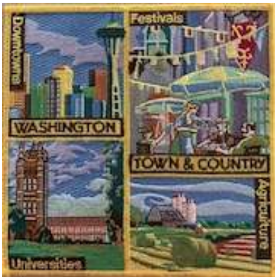
Town and Country