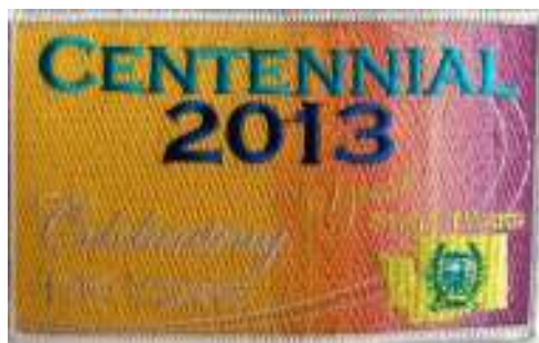
WA. State Parks Centennial