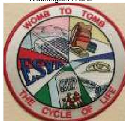
Womb to Tomb