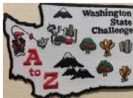
Washington A to Z